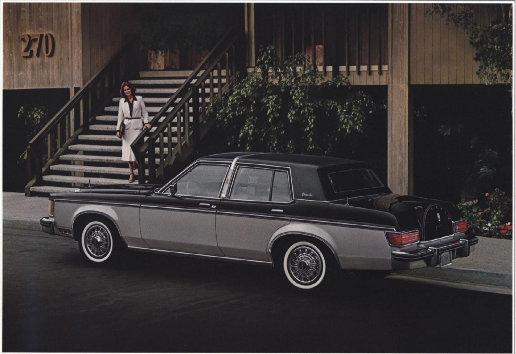
The 1980 Lincoln Versailles in Black and Silver Metallic Dual-Shade paint option