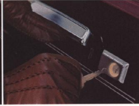
1980 Lincoln Versailles in Cordovan with Cavalry Twill vinyl half-roof