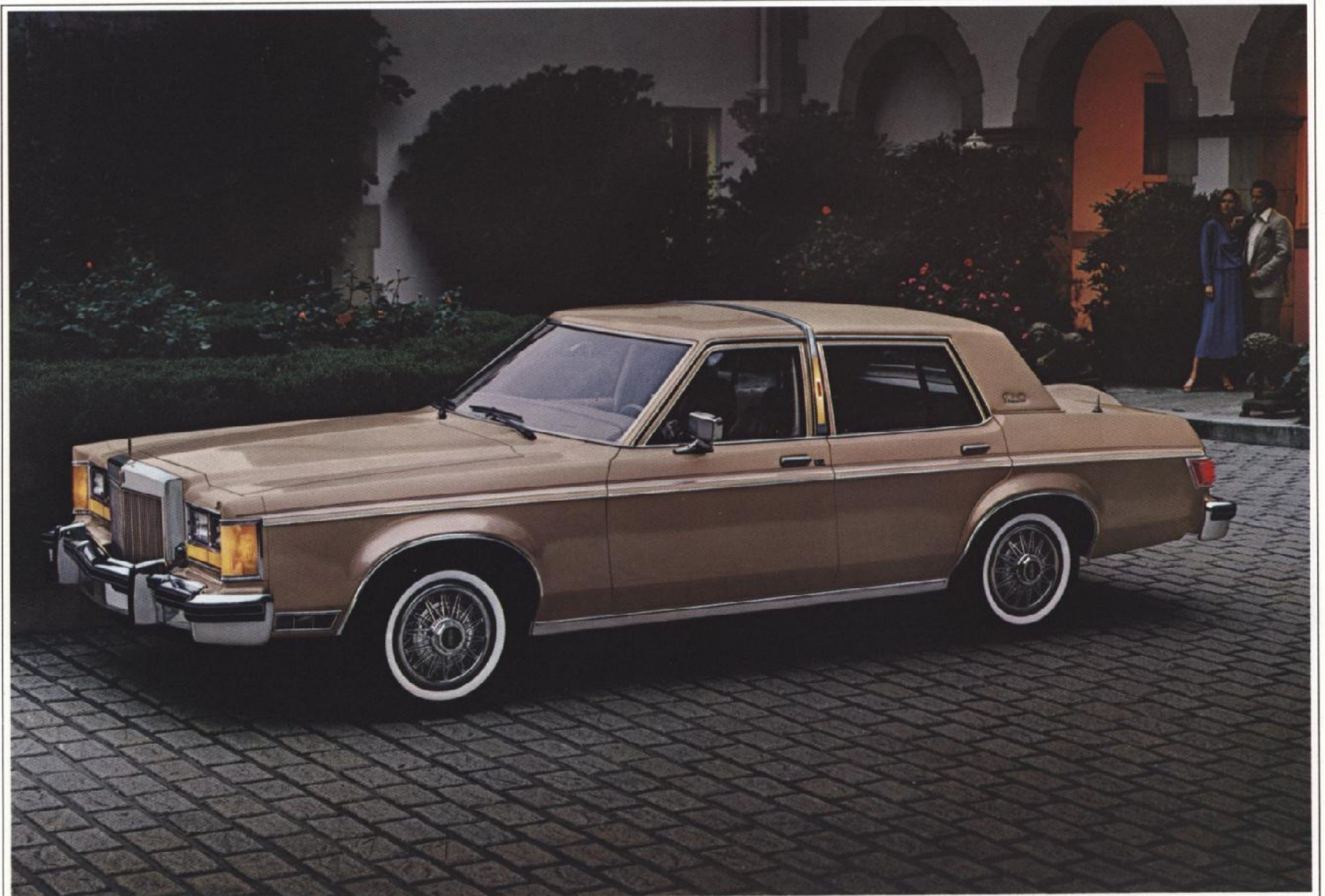
1980 Lincoln Versailles in Light and Medium Fawn Metallic Dual- Shade paint option and Coach roof