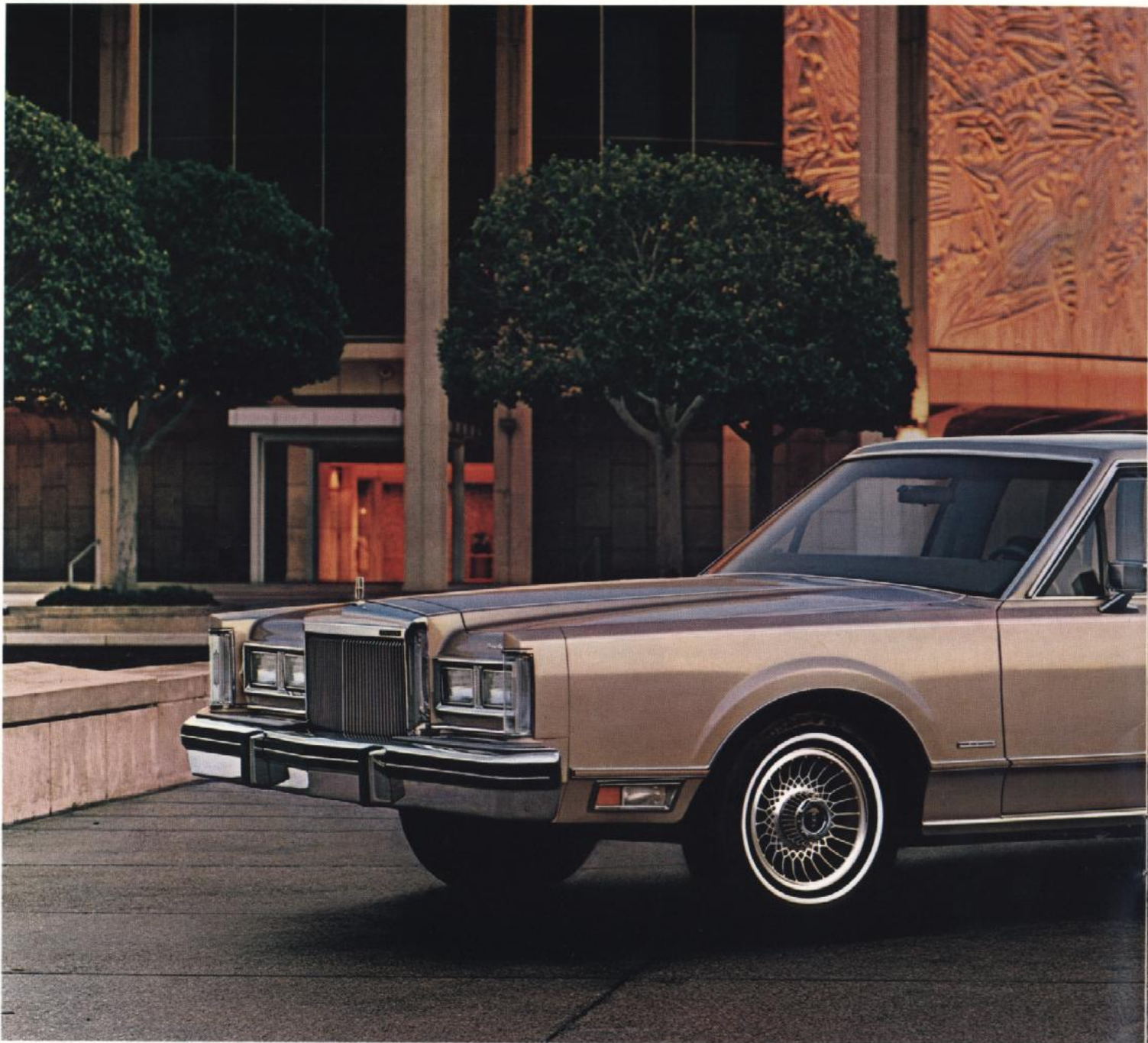
Lincoln Town Car Signature Series four-door with standard vinyl Coach Roof.