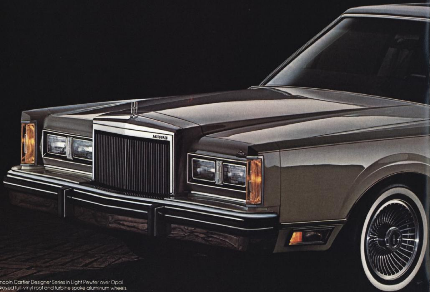
The 1982 Lincoln Cartier Designer Series in Light Pewter over Opal with color-keyed full-vinyl roof and turbine spoke aluminum wheels.