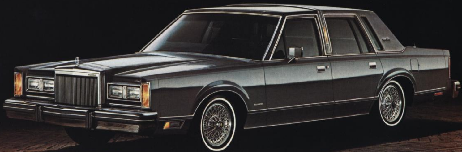
The 1982 Lincoln Signature Series in Medium Dark Pewter Metallic with color-keyed coach roof and optional wire spoke aluminum wheels.