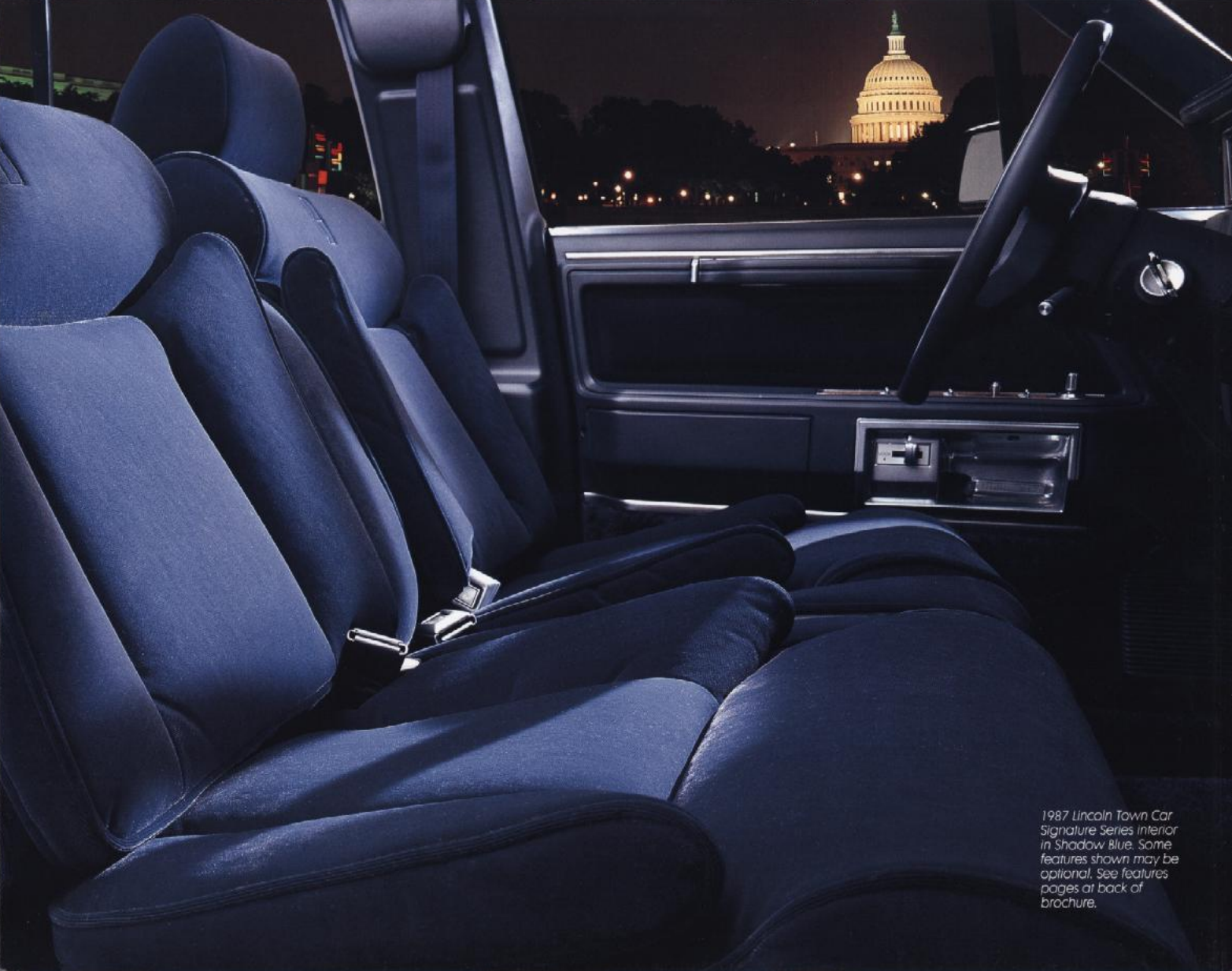
1987 Lincoln Town Car Signature Series Interior in Shadow Blue. Some features shown may be optional. See features pages at back of brochure.