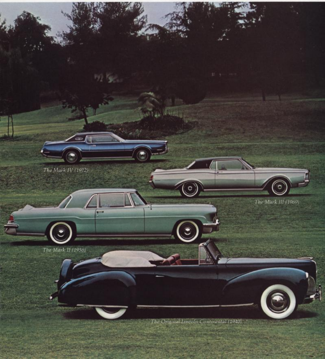
The Mark IV (1972)