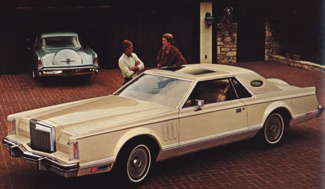
Continental Mark II in background

The Continental Mark V—newest expression of the classic Continental series which began with the original custom-crafted Continental introduced in 1940.